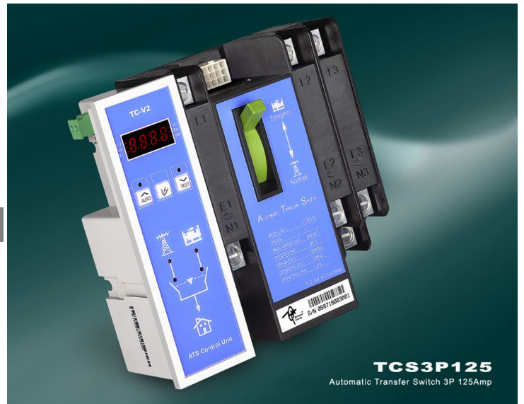
TCS3P125 Automatic Transfer Switch 3P 125Amp